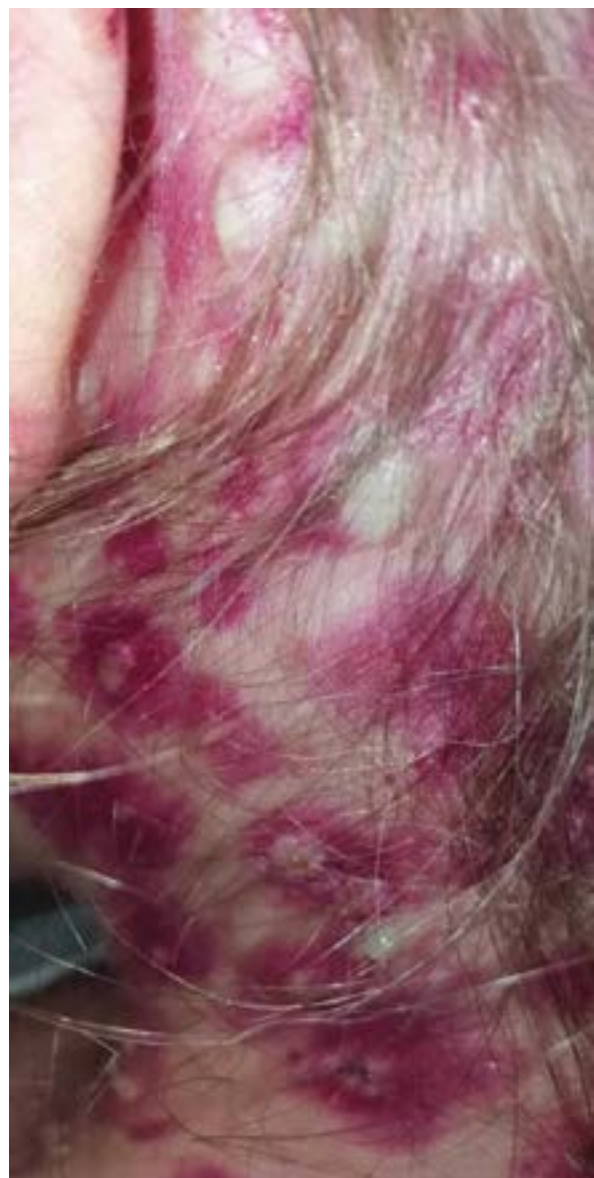
Fig. 2. Pustules behind the ear on the day of admission

A 4-year girl was admitted to the Vinnytsia Regional Infectious Paediatric Hospital due to a fever of 39.2°C, rash, weakness, loss of appetite, and severe pruritus. She was sick for 6 days with a maculopapular, vesicular rash.