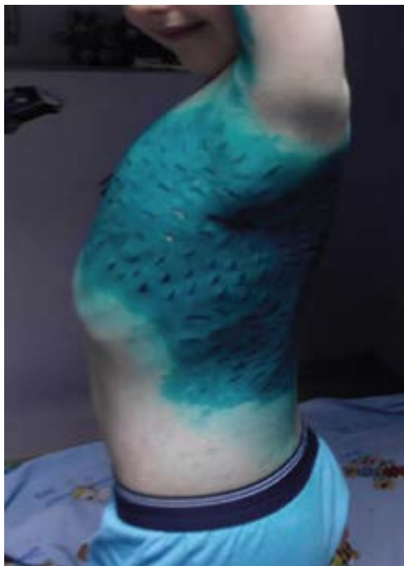
Fig. 4. Severe scarring after surgical treatment of phlegmon caused by varicella in a 5-year-old patient

home. Redness of the skin appeared in the morning, and the boy was admitted to the hospital (Fig. 3). He was not vaccinated against varicella, and had no immune suppression or comorbidities. The boy had contact with a friend with chickenpox 14 days before developing symptoms. The patient was examined by a surgeon and transferred to the Regional Paediatric Hospital for further treatment. The results of the laboratory investigations were as follows: WBC 19.6 \times 10^9/L , ESR 38 mm/h, segments 76%, CRP (C-reactive protein) 36 mg/mL (positive). Varicella was confirmed by a positive IgM VZV result from an ELISA kit. Other laboratory tests were not performed to confirm the aetiology. In the surgical department, treatment consisted of surgical incisions to stop the spread of the pathological process, and prescription of antibiotics (ceftriaxone 50 mg/kg/day by IV for 10 days, amikacin 15 mg/kg/day by IV for 7 days). Acyclovir was not prescribed. The patient spent 14 days in the surgical department. The boy was discharged with severe scarring of the lateral part of the thorax (Fig. 4).