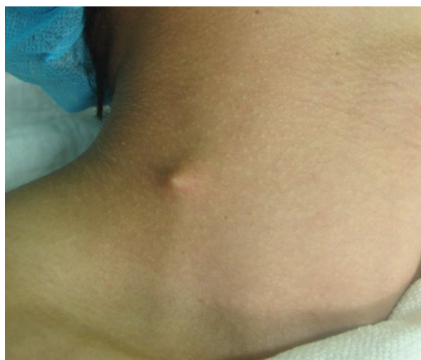
Fig. 1. Fish bone abutting the skin over the right side of the neck

The patient underwent right neck exploration under general anaesthesia. Intraoperatively, a sharp fish bone measuring 2 cm was found embedded in the scalene muscle (Fig. 3), lying posterior to the external jugular vein and was removed entirely (Fig. 4). Although non-purulent, the wound was washed with copious amount of diluted 10% povidone and closed primarily. He completed 5 days of intravenous cefuroxime 1.5 g TDS and metronidazole 500 mg TDS and was sent home well. He was discharged from review at 2 weeks post operatively after full recovery.