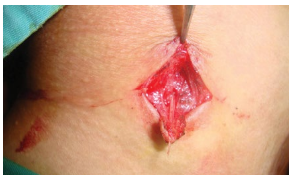
Fig. 3. Fish bone found embedded in the scalene muscle

A complete history, physical examination and endoscopic evaluation are vital to arrive at the primary diagnosis of an ingested foreign body. Patients with an ingested foreign body commonly present with symptoms of choking, dysphagia, odynophagia or dysphonia. In some cases, these manifestations do not always correspond with the actual location of the foreign body; hence, it may be wise for the primary care doctor to have an index of suspicion on the possibility of a migrated foreign body. Fish bone can occasionally be found embedded in the palatine tonsils or base of tongue through inspection of the oropharynx using a tongue depressor and good light source. It can also be found impacted