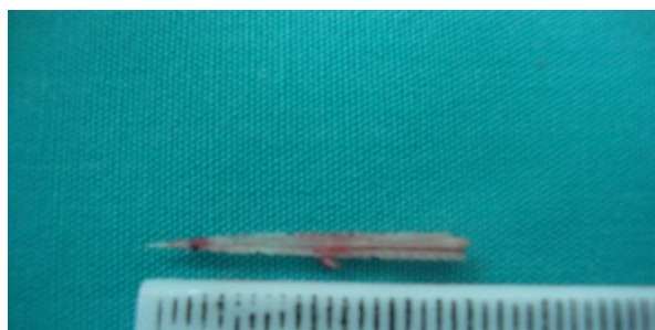
Fig. 4. A linear sharp fish bone measuring 20 mm

in the valleculae, the pyriform fossa or arytenoid cartilages by performing a flexible fiberoptic endoscopy (2) . Streaks of blood and oedema in the hypopharynx may be suggestive of migratory foreign body or trauma due to the spontaneous dislodgement of the foreign body. Pooling of saliva at the pyriform fossa is another important sign that the foreign body might be impacted lower down in the oesophagus.