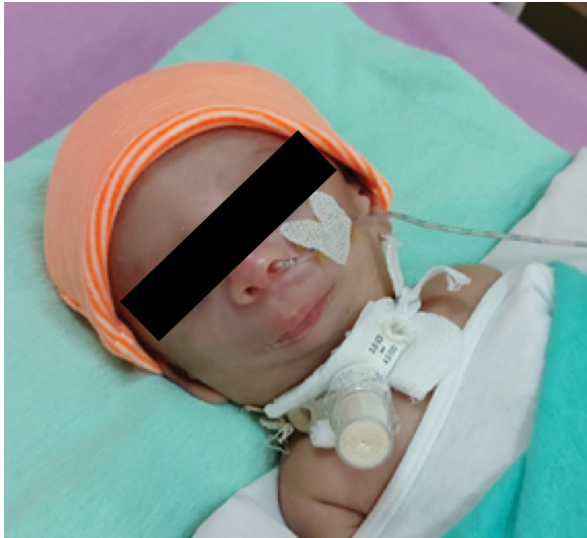
Fig. 2. Infant post tracheostomy

hydronephrosis of the kidney, left lung hypoplasia, and echocardiography findings of trivial tricuspid regurgitation with a peak pressure gradient of 18 mm Hg.