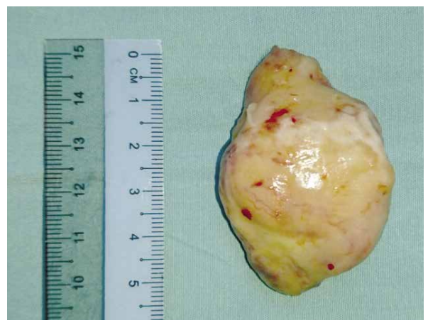
Fig. 3. Polypoidal mass with a stalk