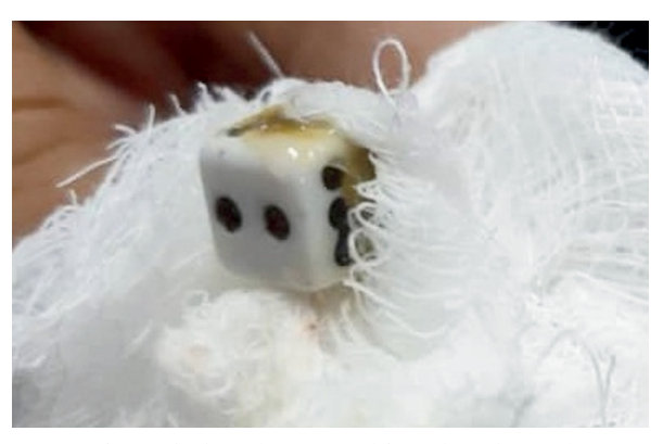
Fig. 3. A foreign body (a die) removed from the right nasal cavity

observed at that time. In addition, no one witnessed the event of foreign body insertion. Left anterior rhinoscopy revealed normal findings. The impression at that time was extension of the girl's haemangioma to the right inferior turbinate with crust formation. The patient was discharged home with nasal douching, and an appointment was scheduled in 3 days to review. However, a parent brought the patient back to the clinic on the next day, as a whitish foreign body was discovered in the child's right nasal cavity after nasal douching. Anterior rhinoscopy revealed a whitish die in the right nasal cavity, between the nasal septum and the mid-part of the inferior turbinate (Fig. 2). The foreign body, which was a die (Fig. 3), was successfully removed by a single attempt in the clinical setting, using a Jobson-Horne probe. The patient was well after the foreign body removal, and no further complications were noted.