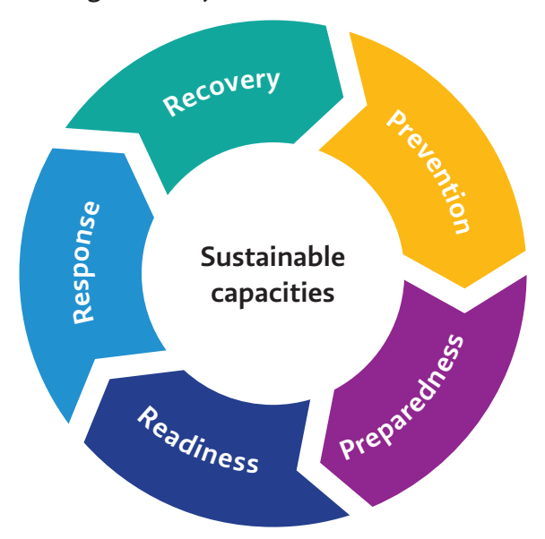
Fig. 1. The full emergency management cycle

Prevention, preparedness, readiness, response and recovery exist on a continuum (Fig. 1). Countries that had invested in preparedness in the wake of past health emergencies such as Ebola virus disease and severe acute respiratory syndrome (SARS), including adoption of a coordinated multisectoral approach, community engagement and improvements to infection prevention and control in the community and in health care facilities, have been better able to prevent and control subsequent disease outbreaks, including the current COVID-19 pandemic<sup>5,6</sup>.