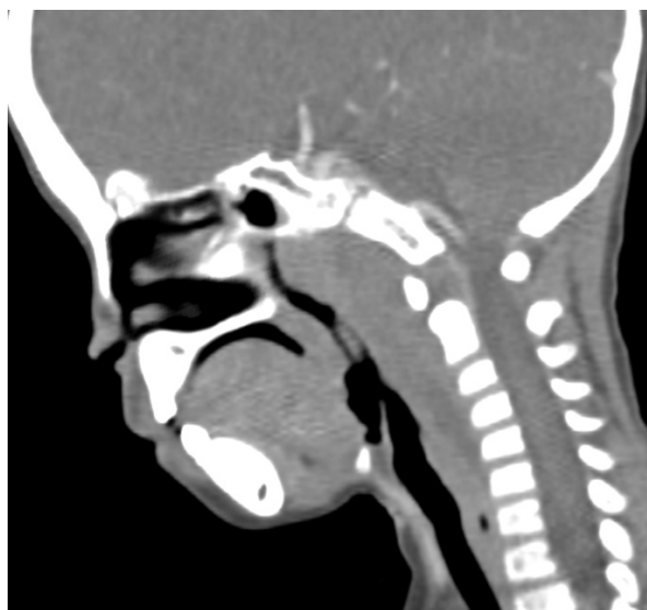
Fig. 1. Fullness of the retropharyngeal space at the level of the nasopharynx and oropharynx