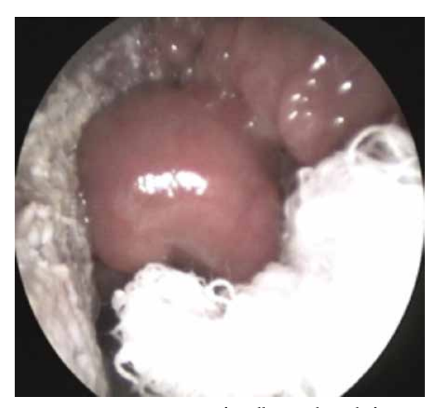
Fig. 1. Intraoperative picture of swollen epiglottis before pus evacuation

During FNPLS, the epiglottis, bilateral arytenoids, and false cords were oedematous. The patient was successfully intubated with an endotracheal tube size 7.5 mm. Blood results showed elevated total white blood cells (TWBC) of 20.7 \times 10^3/\mu L and C-reactive protein (CRP) of 20.7 \times 10^3/\mu L and the started on intravenous dexamethasone and intravenous amoxicillin/clavulanate acid, and was monitored in the Intensive Care Unit (ICU).