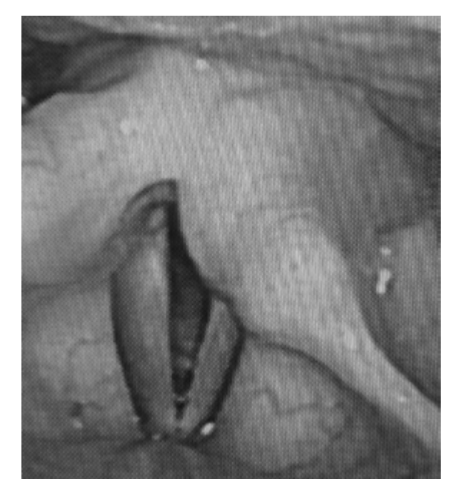
Fig. 1. Flexible nasopharyngolaryngoscopy reveals a paralysed left hemilarynx with the left vocal cord in the paramedian position

During the review, the patient was sitting comfortably under room air, with no signs of respiratory distress. There was no stridor audible, however her voice was breathy. Intraoral and neck examinations were unremarkable. The lungs were clear. Anterior rhinoscopy and otoscopy were both clear. Flexible nasopharyngolaryngoscopy was performed which revealed immobility of the left hemilarynx, with the left vocal cord in the paramedian position, and mobile right vocal cord with phonation gap (Fig. 1). There was no mucosal lesion or mass seen in the supraglottis, glottis or subglottis. All other cranial nerves were intact, with no other neurological deficits. All blood tests, including complete blood count, renal profile, erythrocyte sedimentation rate, rheumatoid factor, and antinuclear antibodies, were normal. Chest radiography was also normal, with no cardiomegaly, widening of the mediastinum or signs of lung pathology. Consequently, contrast-enhanced computed