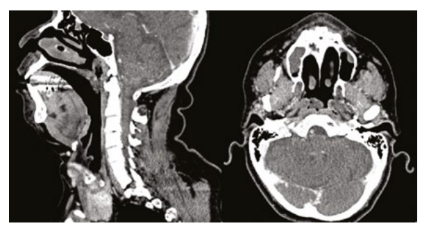
Fig. 2. Computed tomography of the neck revealing non-enhancing nasopharyngeal soft tissue lesion

history revealed a strong family history of malignancy as patient's father had colorectal cancer and his mother suffered from cervical cancer. Other than that, there were no constitutional or B symptoms.