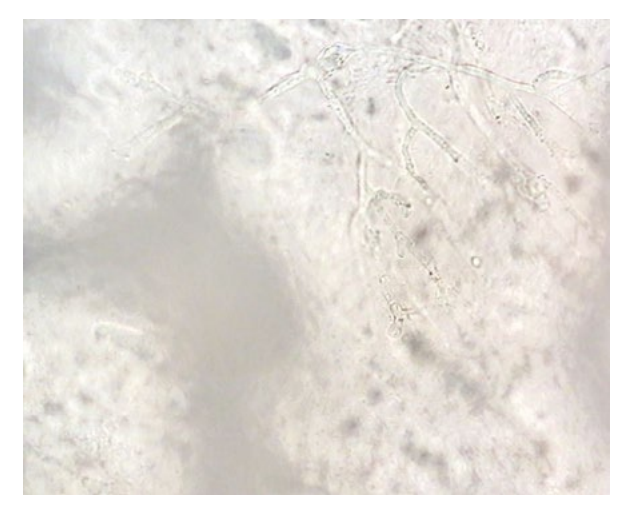
Fig. 2. Morphology of the fungal hyphae identified under light microscopy was that of aseptated fungal hyphae with branching patterns