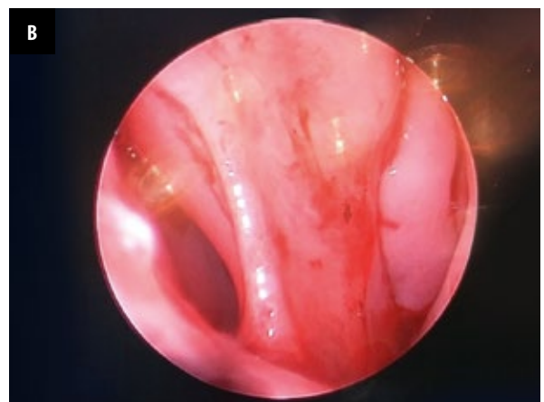
Fig. 1 A. Button battery removed from left nasal cavity; B. An endoscopic view of the left nasal cavity showing anterior septal perforation