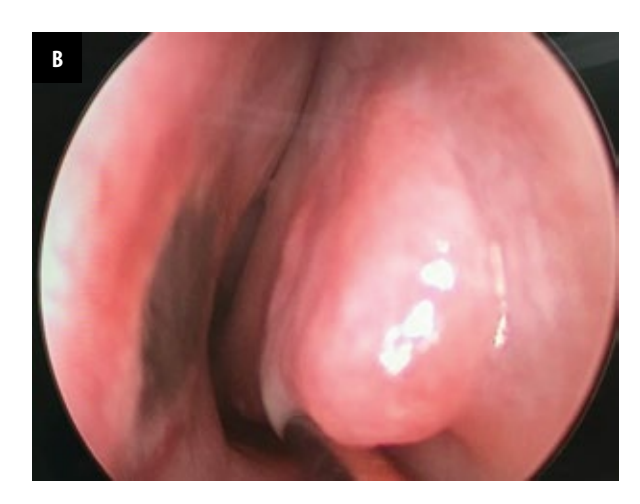
Fig. 2 A. An endoscopic view following removal of the battery showing mucosal ulceration and necrotic area of the right inferior turbinate, middle turbinate and septum; B. Discoloration of the left nasal septum mucosa with no evidence of perforation revealed after removal of button battery

in the left nostril with minimal clear serous discharge. Nasal radiographs (Fig. 3) revealed a radiopaque foreign body in the left nasal cavity with typical bilaminar structure. As the patient was cooperative and the foreign body was easily seen, the removal was done in the clinic without anaesthesia, it was found to be a button battery that impacted between the left inferior turbinate and nasal septum. Endoscopic examination post removal revealed minimal mucosal oedema and ulceration with intact nasal septum. The patient was treated conservatively, and was followed up for a period of 3 months. The nasal mucosa was well healed without any apparent permanent sequelae.